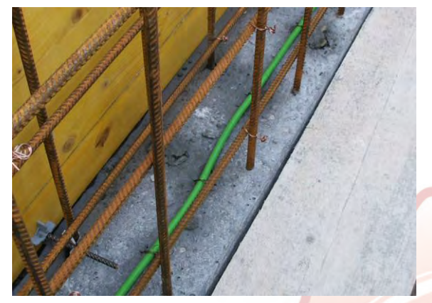
The hose has to be well set on the cold joint and has to be fastened with hose clamps at approx. 15 cm distance (depending on surface of the concrete of the construction joint).

Put the hose in the middle of the cold joint. The connection, ventilating hose / PREDIMAX/CEM 11 has to be placed completely inside the concrete structure.