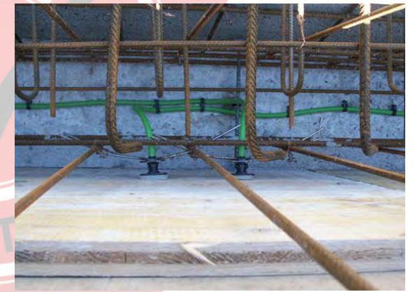
Installing the ventilation hoses inside an end box : Important: Ventilation hoses have to be fixed in order to avoid a replacement during the concrete work.